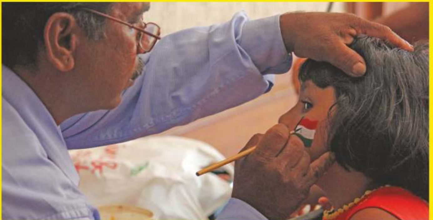
Face painting was a big draw with children during Independence day celebrations.