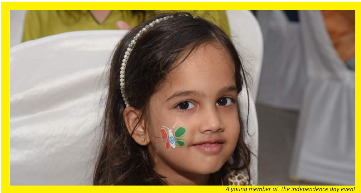
A young member at the independence day event