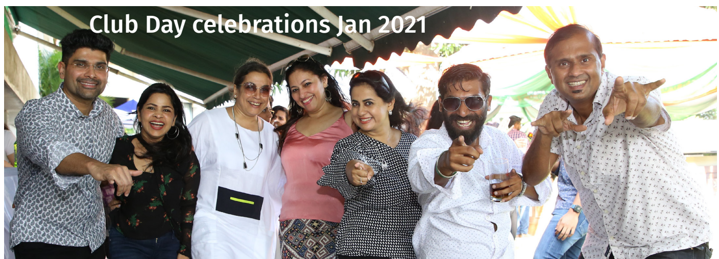
Club Day celebrations Jan 2021